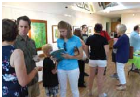
Exhibition - July, 2016

Each year since 2010 a different location in the Fairborn, OH, area has been chosen as the subject for artwork. The 2017 locations are Estel Wenrick Wetlands and Cantrel property. See map and directions to these sites inside this brochure.